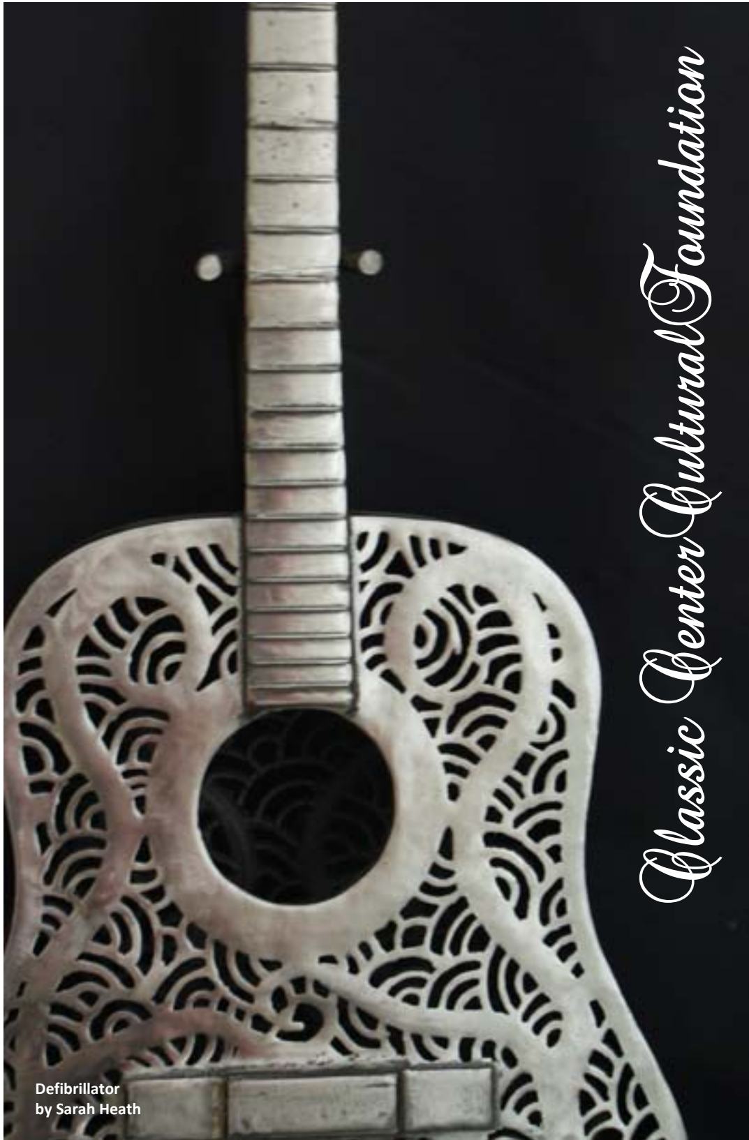
Defibrillator